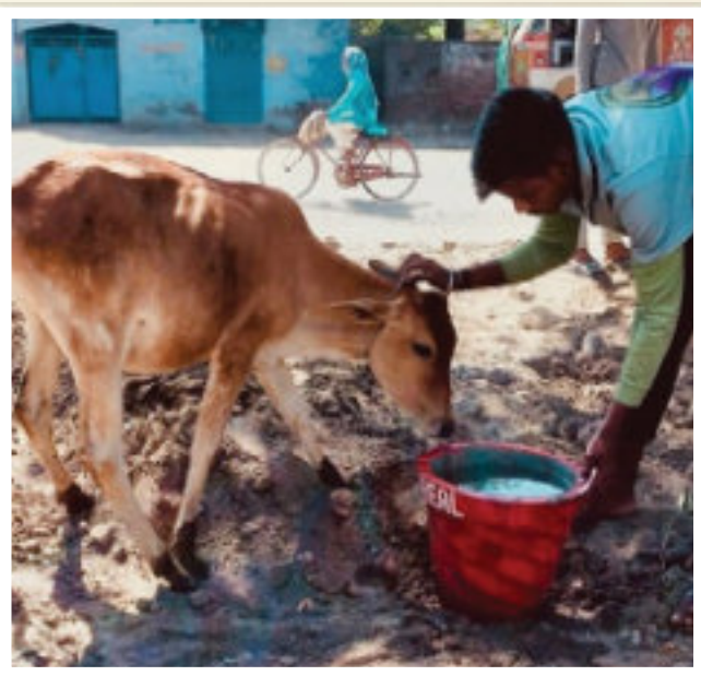
In times of drought, our water bowls save lives.

India's climate brings so many challenges!