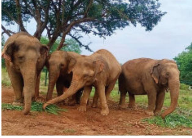
L to R: Pani, Janumani, Aneesha and Gowri (Durga and Lakshmi are grazing elsewhere)

When working animals like donkeys, equines and elephants are abandoned (or rescued) after years of service, our partner charities fill the void with their compassionate care.