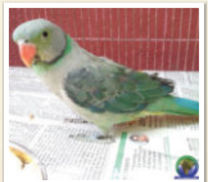
We support WFFC's rescue of all kinds of injured wildlife. This cutie, a slaty-headed parakeet, was fit enough to be released to the wild after rehabilitation!