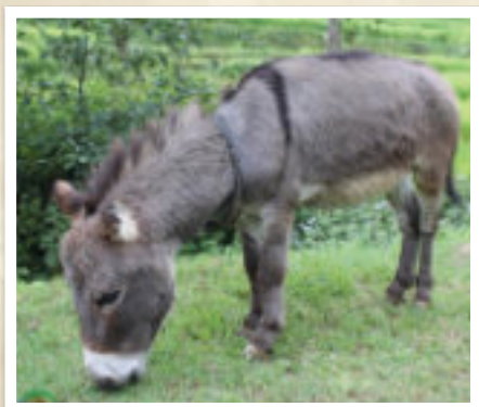
Lava is one of many donkeys rescued from the brutal brick trade by Animal Nepal.