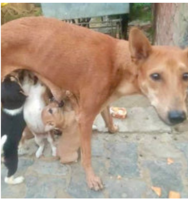
After they've been spayed/neutered and vaccinated, street dogs are escorted back into their communities in class (i.e. in our ambulance)!

With their numbers vvvsoaring into the tens of millions across India, every day street dogs face danger, given the public's fear of rabies and the violence it can provoke. One of our main efforts to defuse the ongoing crisis is in Varanasi and Sarnath where, this summer alone, spaying/neutering and rabies vaccinations were administered to over 500 dogs. Our public education efforts there are enlisting enthusiastic community participation.