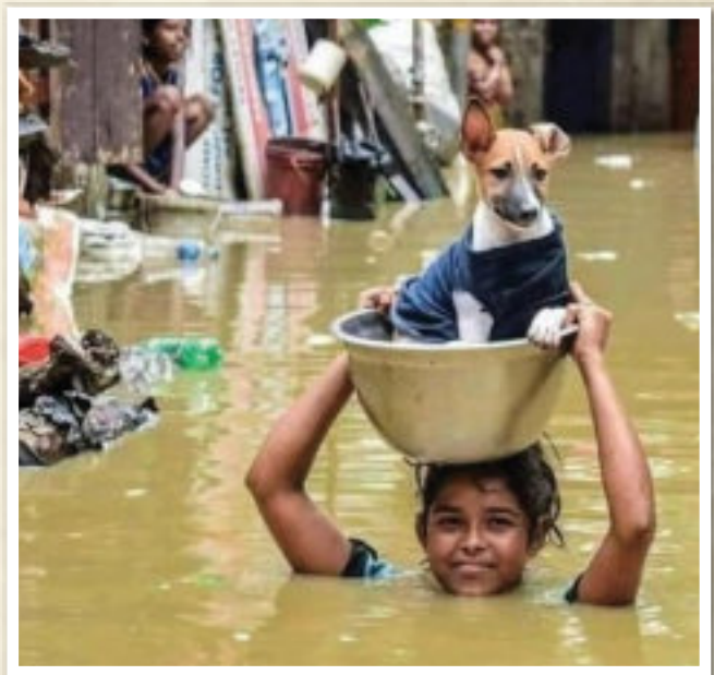
Emergency monsoon flooding is no deterrent for this animal angel.